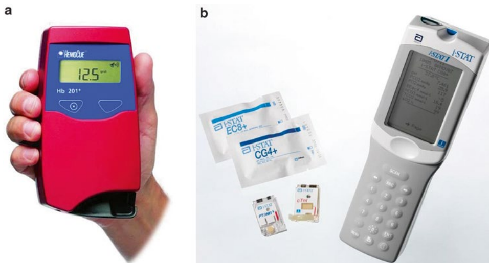
Fig. 14.2 (a) HemoCue. (b) I-STAT.

HCT f —Final hematocrit (lowest acceptable at end of operation)