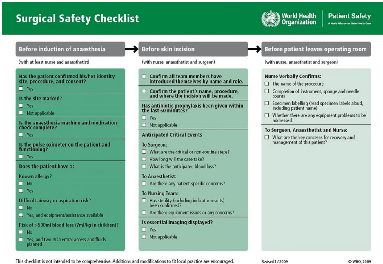
Fig. 14.3 WHO surgical safety checklist. WHO surgical safety checklist, URL: http://www.who.int/patientsafety/safesurgery/en , © World Health Organization 2008 All rights reserved

A healthy patient with a normal starting hematocrit can usually tolerate an acute loss of one third of their blood volume. If you consider that a total estimated blood volume (EBV) is approximately 70 ml/kg (slightly more in infants and less in adult females) then a short way to estimate MABL is to divide 70 ml/kg by three, which is just over 20 ml/kg. Most patients who are healthy and have normal starting hemoglobin will tolerate 20 ml/kg blood loss without needing transfusion. In many situations blood may not be available and when it is, often it can take days to obtain. Thus the responsibility lies with the surgeon to make sure that there is a wide margin of safety in regards to surgical blood loss and to always be prepared for the worst possible scenario.