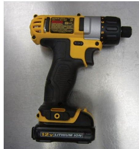
Fig. 14.5 12v cordless variable-speed drill

In spite of these results, commentaries have been published against the reuse of external fixation devices [9] that are not scientifically based, do not apply to limited-resource environments and add fuel to medicolegal fears. The reuse of external fixators can be safely done if the appropriate reprocessing methods and inspection are implemented.