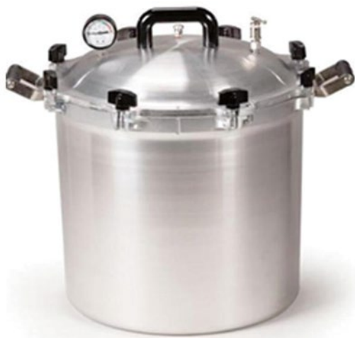
Fig. 14.4 All-American stove-top sterilizer autoclave. Reprinted with permission of Wisconsin Aluminum Foundry

Sterility is a principle that should never be compromised no matter what the situation. A brief discussion is warranted about several options for sterilization, since we as surgeons are not typically involved in the process and do not have the knowledge to assess whether or not various methods provide safe sterilization. In order for something to be considered sterile with autoclave processing, it must reach 121 °C/250 °F with a pressure of 15 psi/100 kPa for 15 min. Indicators are available and should be used routinely. These are an easy and compact addition to the list of essential surgical materials that can be taken on a trip. This can be especially important in situations where aging autoclaves and maintenance schedules may not be strictly adhered to. If a reliable autoclave is not available some portable stovetop units can be acquired and their cost is not prohibitive (Fig. 14.4). These units come in various sizes and can accommodate a variety of surgical instruments; the larger sizes can accommodate larger instruments and implants but are not able to accommodate intact full size instrument trays.