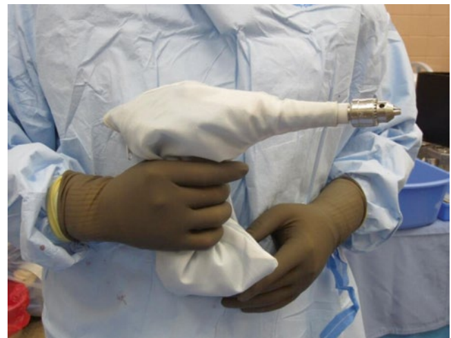
Fig. 14.6 Cordless drill kit shown with sterile cover and surgical chuck