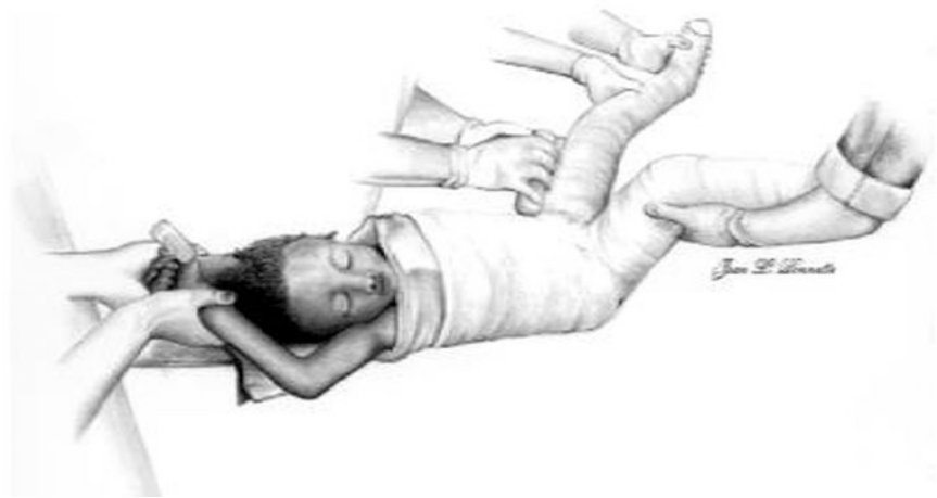
Fig. 14.8 Hip spica application. After appropriate anesthesia, the patient's torso is placed supine on the end of the armboard. Three assistants are used to stabilize and position the patient's arms/head region and each of the lower extremities. Standard casting materials, including a temporary towel to pad the patient's back, are used to complete the hip spica cast. Reprinted with permission from Pasque C, Harbach G. Hip spica application using an operating table armboard. J Pediatr Orthop 2000; 20(6)

and made available to surgeons and institutions at minimal cost. This has revolutionized long bone fracture care around the world with more than 120,000 cases performed. SIGN has established programs in more than 55 countries where surgeons have had the necessary training and experience. Accountability, quality control and maintenance of a sustainable inventory are realized through the use of a database that requires uploading of preoperative and postoperative images as well as input of case data and implant use. There is a learning curve to using the system, which has some unique features enabling distal interlocking without X-ray guidance. This system is useful in limb deformity correction when stabilizing osteotomies or even performing lengthening over nails. Fixator assisted nailing is also a useful technique for a variety of long bone deformities. There is a pediatric version of the SIGN nail available; however, the standard nail is suitable for a trochanteric entry and may be used in older children. The pediatric nail is more useful for fractures and has a unique distal interference fit without a distal interlocking option. The standard adult nail comes in sizes as small as 8×200 mm, making it versatile for deformity corrections in relatively small patients.